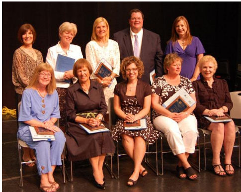
10 Outstanding Educators

Deadline for submissions to this newsletter is each Wednesday @ noon